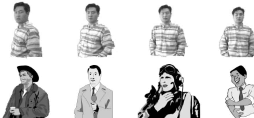
Figure 5. Results for the sequence People-2 . Top: From left to right – segmented objects views from frames 22, 26, 29, 32 of the video sequence People-2 . Bottom: From left to right – best matches from the database for the object view displayed above.

on non-rigid objects. First of all, it is straightforward to extend the database and provide more prototypes covering different motions and postures. Second, the rotation invariance of the matching procedure could be restricted. Following our approach of using canonical views, it is reasonable to allow only a certain degree of rotation when matching object views to those in the database.