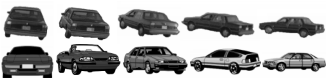
Figure 4. Results for the sequence Car-4 . Top: From left to right – segmented objects views from frames 7, 11, 15, 17 of the video sequence Car-4 . Bottom: From left to right – best matches from the database for the object view displayed above.