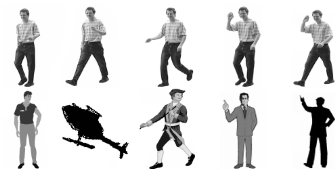
Figure 6. Results for the sequence People-5 . Top: From left to right – segmented objects views from frames 200, 204, 209, 225, 228 of the video sequence People-5 . Bottom: From left to right – best matches from the database for the object view displayed above.