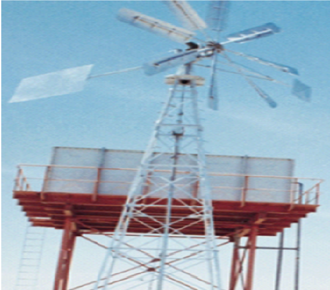
Figure 1. Locally-manufactured wind pump installed at kilo 8 site.

only be used for human intake, that is, drinking and cooking purposes and where the rest of the household water can be provided by means of a dual water supply system (e.g., where water of higher salinity can be used). In Sudan, people are requested to construct solar stills plants by themselves in order to reduce costs. In remote areas, the costs for materials increase by about 15 - 20% due to transportation. In an economic analysis, many factors have to be considered as outlined in Table 22. Due to the lack of knowledge and awareness, villagers cannot be expected to understand the benefits of solar stills, nutrient conservation, or health improvement (Omer, 2009). A poor rural peasant is very hesitant to enter a new venture. The negative attitude towards the use of stills water varies from place to place, but when it occurs, it is a major obstacle to the implementation of solar still technology. In designing the solar still, the following points were considered: the unit has to cost as little as possible and materials should be readily available in rural areas. Technology should be simple, within the reach of a common village man. The unit should be usable in situations of emergency, e.g., during floods and