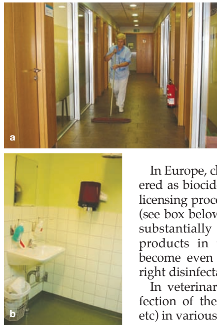
Figure 2 (a) The cleaner at the University of Barcelona Veterinary Hospital, Spain, works all through the day (and not just before opening time, as in so many hospitals). This spotless hospital prioritises hygiene over appearance. (b) Rounded corners where floor meets wall in this veterinary hospital consulting room in Stromsholm, Sweden, facilitate floor cleaning.

In veterinary practice, cleaning and disinfection of the surfaces (floors, walls, tables, etc) in various areas of the clinic has to be performed on a regular basis, up to several times a day (Figure 2). In both the veterinary clinic and shelter setting, special attention has to be given to the use of products with proven efficacy against a broad spectrum of microorganisms and viruses, which are safe for use with animals (and used in compliance with local regulations).