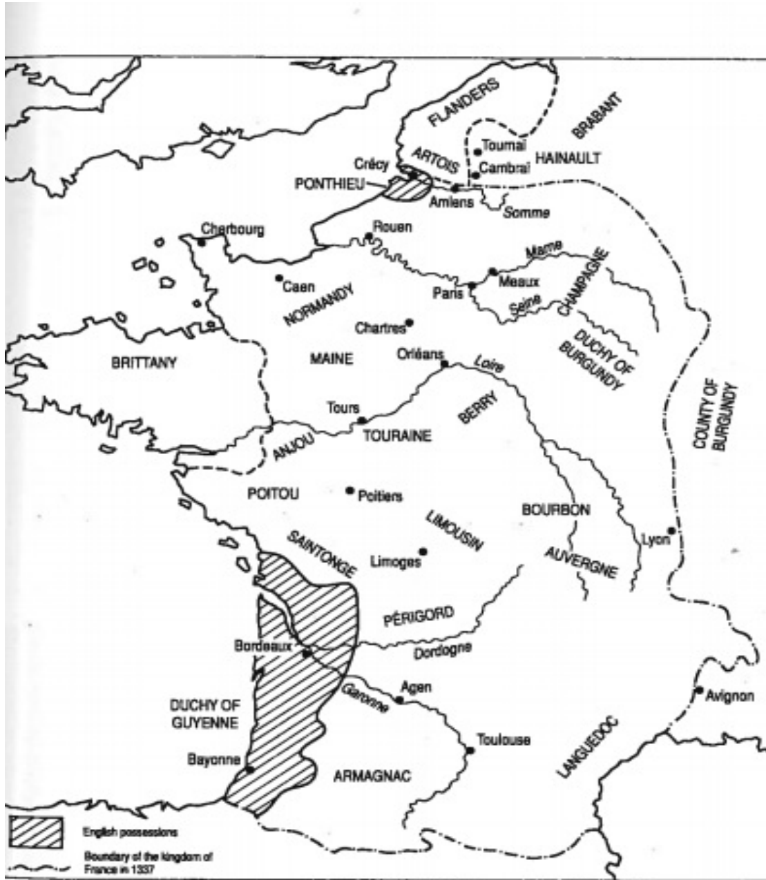
France at the beginning of the Hundred Years War.

Burgundy sided with France again due to a problematic alliance with England and the resurgence of a French monarchy.