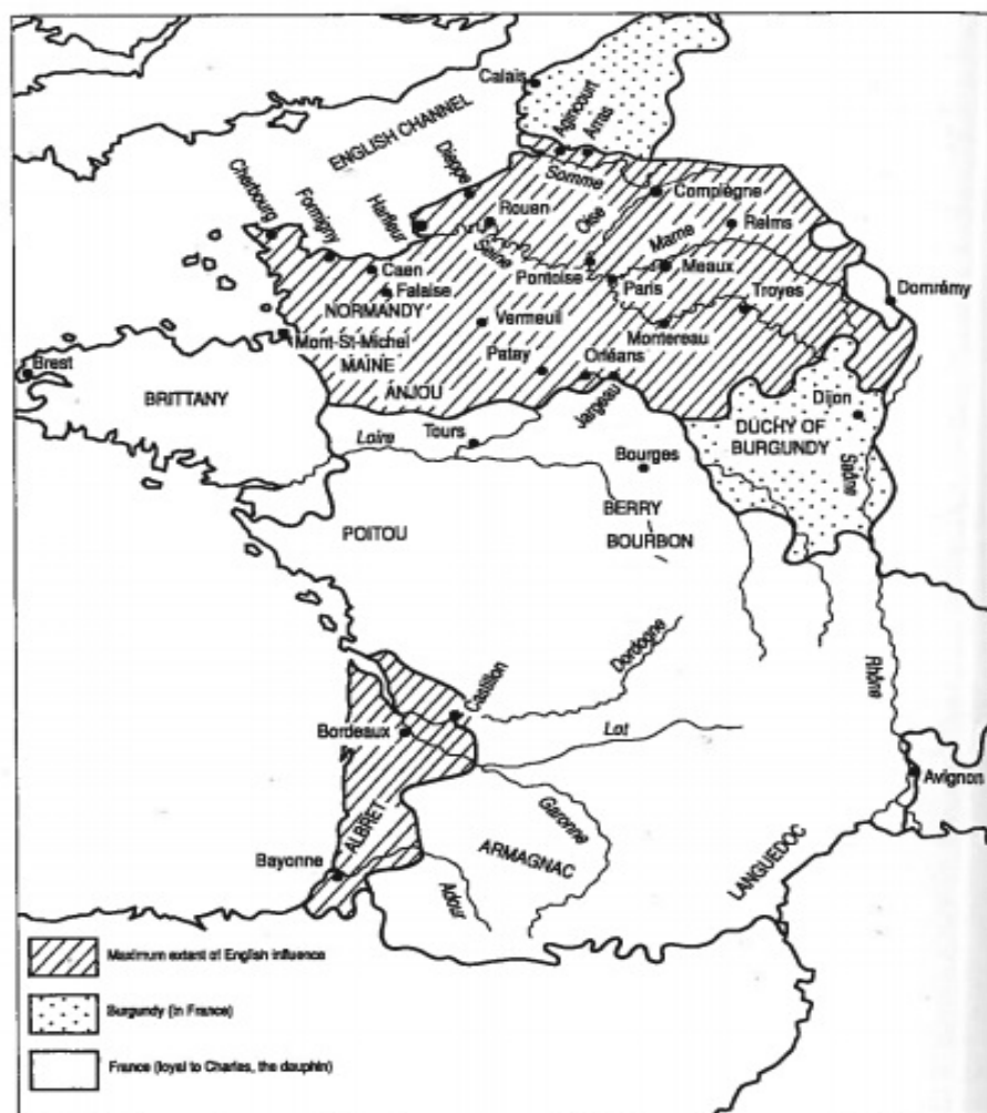
France in 1429.