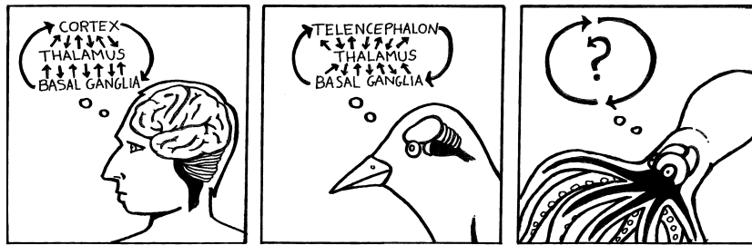
Fig. 2. Possible neuroanatomies of primary consciousness. In humans, primary consciousness is associated with the highly reentrant thalamocortical system. In birds, a functionally analogous system may involve regions of the telencephalon, the thalamus, and basal ganglia. Cephalopod neuroanatomy is currently insufficiently characterized to advance functionally analogous structures with much confidence.

of the investigations of neuronal physiology that followed (Hodgkin, 1964; Katz & Miledi, 1966; Young, 1939).