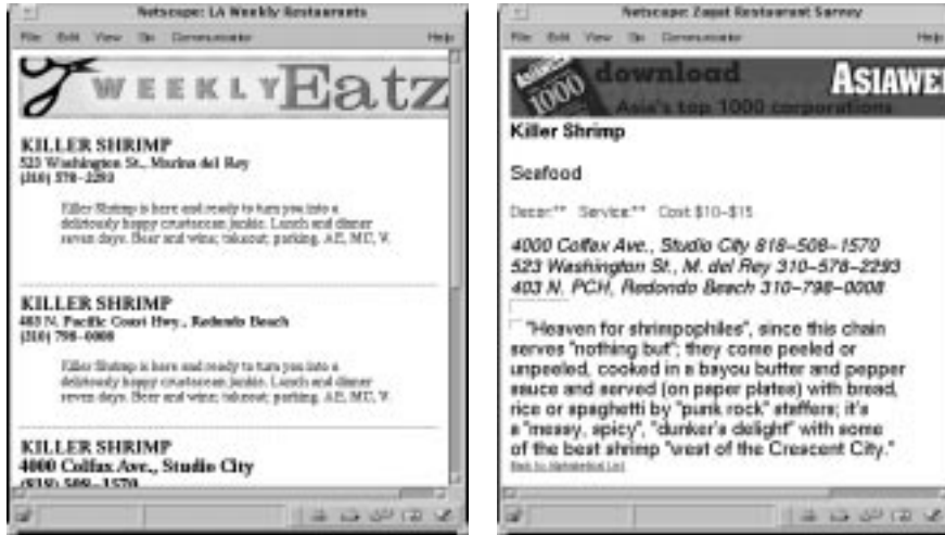
Figure 1. LA-Weekly and Zagat’s Restaurant Descriptions