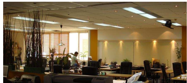
Figure (3) Integrating daylight and artificial when the amount of daylight is insufficient

Recently, many monitoring studies have been conducted to determine the ways in which students are affected by the indoor environment. Beside the daylight effects, many aspects of indoor environments can affect students' performance; these aspects are discussed in the next sections. Because daylight cannot generally meet all of a building's daytime lighting requirements, artificial lighting can be used whenever the amount of daylight is insufficient. Integrating daylight and artificial light is required for the visual indoor environment. The optimal solution combining the daylight and artificial light depends on the type of building, its use, and other local environmental aspects.