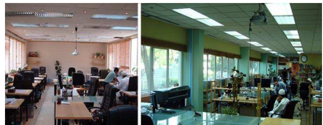
Figure (1) Samples of the classrooms at the Faculty of Environmental Design, KAU.

The primary goal of this study is to examine some classrooms in the educational buildings at King Abdul Aziz University to determine whether daylight can affect student performance. Collect information about the natural lighting conditions in the classroom is the first step to test the impact on student performance. Also other aspects of the internal environment of the classroom affect student performance and interact with the light of day. To achieve the objective of the study, information about the selected classrooms, including, along with natural lighting, HVAC, ventilation, windows and roof coverings, and opinion, and the quality of indoor air, has to be considered. Figure (1) shows examples of the Faculty of Environmental Design classrooms.