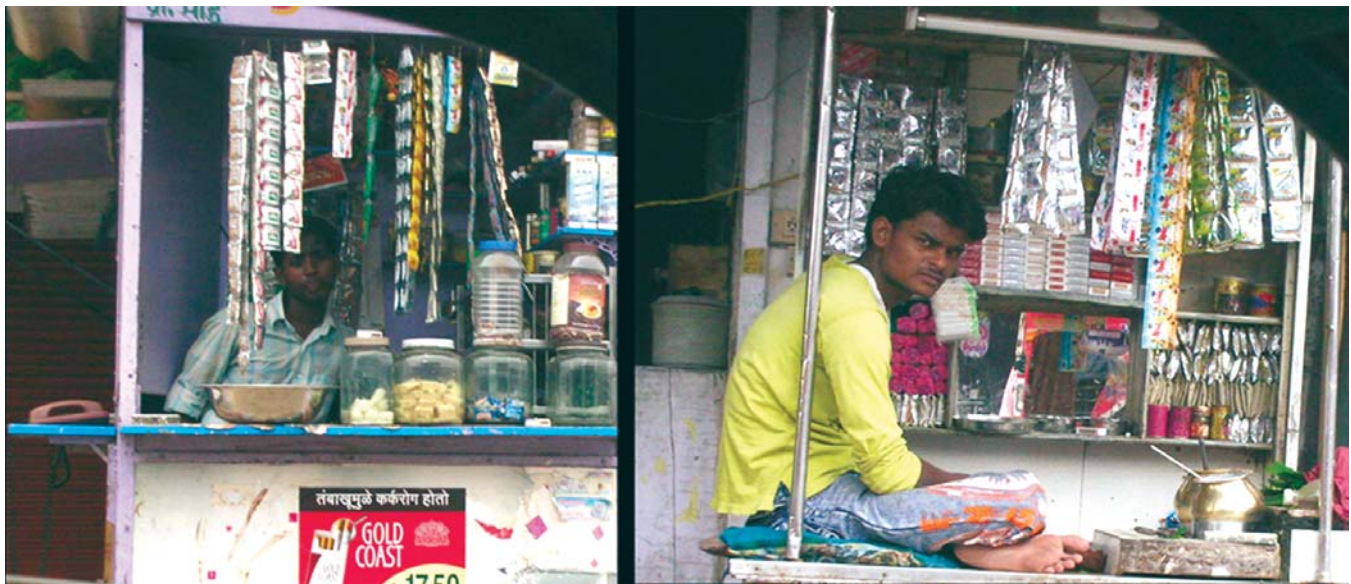
Fig. 2: Pictures showing young boys selling tobacco and areca nut products in Mumbai. Areca nut products are freely available to younger generation who consider it as a mouth freshener

millions of Indian. To begin with, a strong pictorial health warning or at least a textual statutory warning should be made mandatory on all such products. Even in absence of such a law, it is the responsibility of the manufacturers to inform their patrons about the hazardous nature of their products. In addition, there should be a ban on advertising (direct and indirect) of this product, ban on sale to minors, impose restriction on chewing in public place/work place and spitting should invite big penalty. The California Environment Protection Agency has listed Areca nut as carcinogen and a hazardous product. 22 Taiwan, the land of