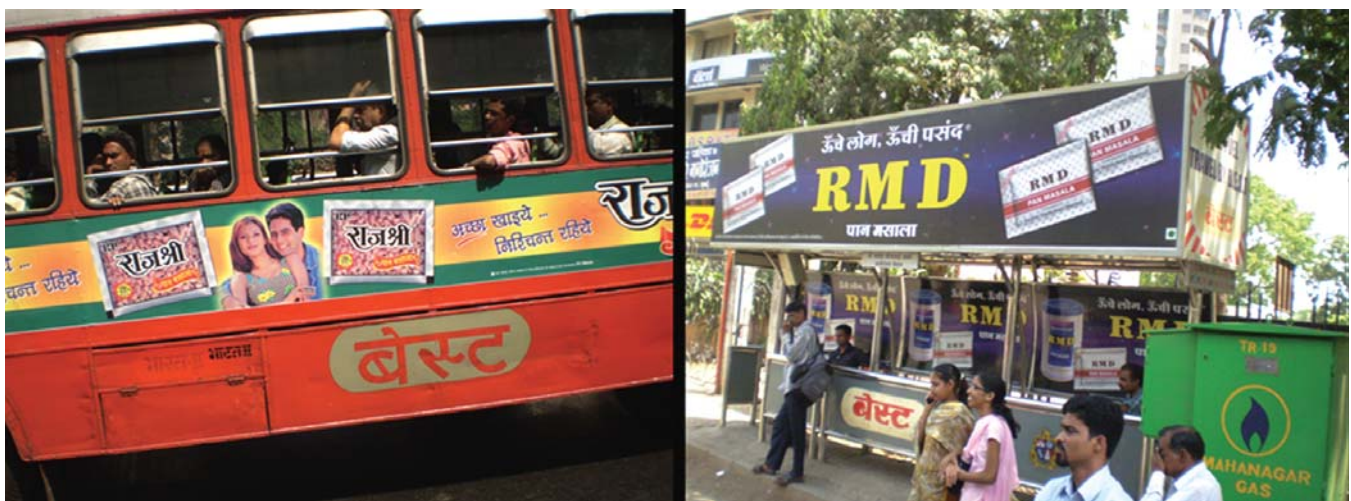
Fig. 3: The BEST buses and the bus shelters in Mumbai sporting Gutkha/Pan Masala ads. With ban on tobacco ads, these companies blatantly advertise (surrogate advertisement) areca nut product with same name as tobacco containing counterparts. Needless to say that all ads contain misleading messages for the consumers