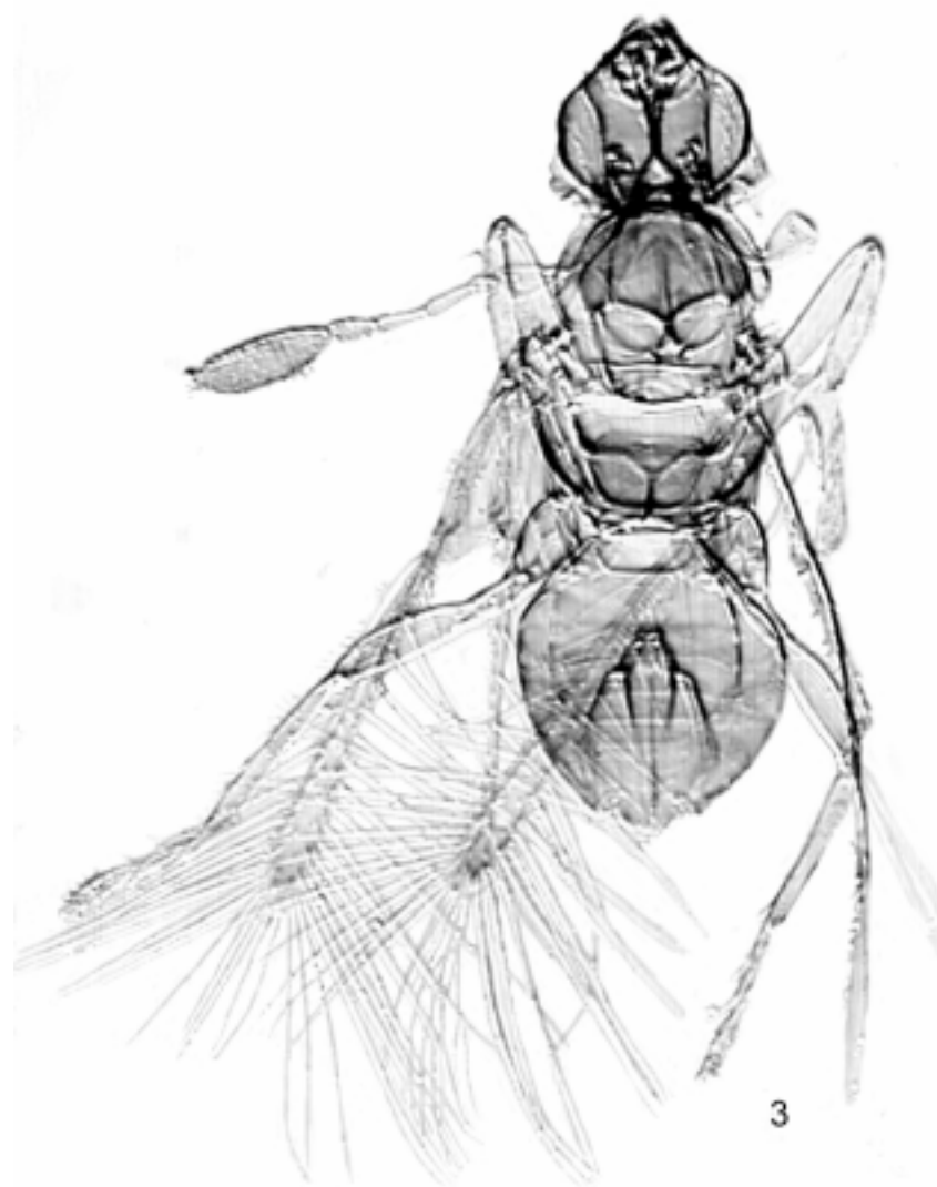
Figure 3. Kikiki huna Huber. Holotype, ventral view.