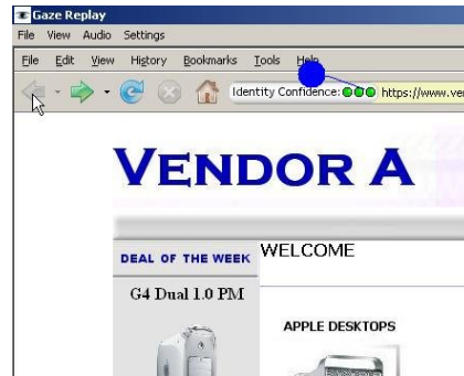
Fig. 3. A screenshot of the eye tracker replay function. The large circle near the identity confidence indicator shows the participant's fixation on that region of the screen.

One of the more interesting findings in the eye tracking data was how long users spent gazing at the content of the web pages as opposed to gazing at the browser chrome. On average, the 15 participants who gazed at traditional indicators, new identity indicators, or both, spent about 8.75% of time gazing at any part of the browser chrome. The remaining 13 participants who did not gaze at indicators spent only 3.5% of their time focusing on browser chrome as opposed to content. These percentages may have been even lower had the tasks involved in the study taken longer to complete. While other studies have found that many users are unable to distinguish between web page content and chrome, ours suggests they do distinguish between the two and that they rarely glance at the chrome at all. This finding was also supported by the participants' comments during the follow-up interview. When the identity indicators were pointed out to participants, many made comments such as "I didn't even think to look up there" or "I was only focusing on the web page itself."