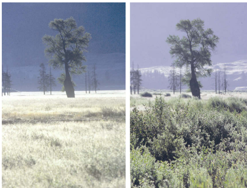
Fig. 2. Comparison photographs taken in 1997 (left) and 2001 (right) near the confluence of two streams in northern Yellowstone National Park showing the height of willow plants during suppression (left photo) from long-term browsing by elk and their release (right photo) following wolf reintroductions that began in 1995 and 1996. This site appears to be high in predation risk because of significant escape impediments for elk due to topographic and stream barriers.

Both nonlethal and lethal effects of wolves (and other large carnivores) can have broader cascading effects on organisms beyond large herbivores. For example, wolf and grizzly bear ( Ursus arctos )