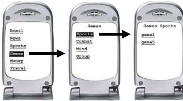
2a: Hierarchical Menu Interface

can verbally input a command to directly activate the desired function or retrieve the desired information (as shown in Figure 2e).