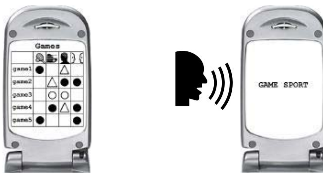
2d: Table-Based Interface