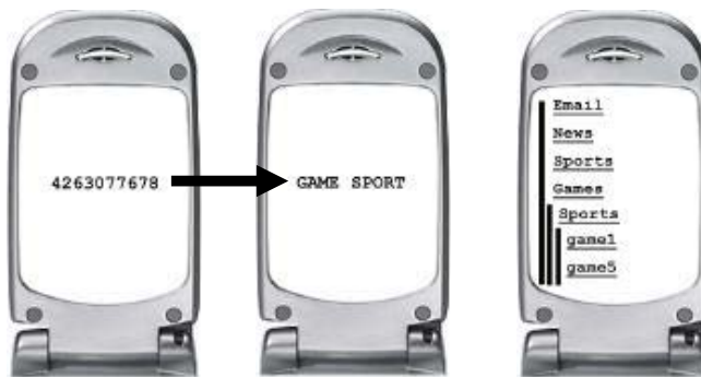
2b: Short-Cut Codes