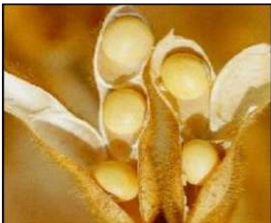
Fig. 4: Soybean seeds

Researchers have demonstrated that soybean isoflavones are associated with a lower risk of cancer [26]. The biodiesel production from soybean has been widely studied and the researches have been proven the potential of this crop for this purpose [27]. Soybean has oil content around of 17% on dry weight basis and a potential yield between 0.2 and 0.4 \text{tha}^{-1}\text{year}^{-1} [19]. Actually, soybean (Fig.4) is cultivated worldwide attesting to the crop success and adaptability. This crop requires temperatures from 20 to 35°C and about 950 mm of water annually to produce maximum yields [28].