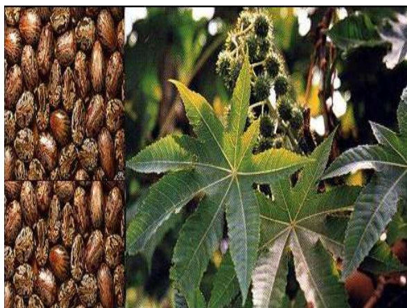
Fig. 5: Castor bean seeds

During the last decades, the expansion of this crop to the Brazilian central cerrado region took place, once varieties had been developed that were adapted to low latitudes. The Southern region is characterized by smallholder farmers, mostly organized in cooperatives, whereas the central region is characterized by large holdings, with very high levels of mechanization and mostly organized in large private groups. In addition, climate is more stable in Central Brazil. The latest soybean expansion has taken place in the Northern Legal Amazon. Currently, soybean production in the North represents only a small fraction of the planted area [30].