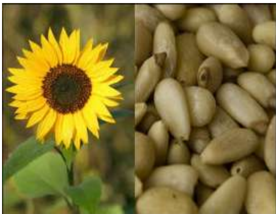
Fig. 3: Sunflower seeds and flower

(South Brazil) through the characterization of regions with low climatic risk for this crop. Based on historical series and on a Geographic Information System (GIS) it was evident that the expansion of the physic nut in the State of Paraná is viable [14]. In another work, the minimum lethal temperature for seedlings of the oil seed plant was determined, aiming at supporting the expansion of physic nut crop in Southern Brazil as an alternative for biofuel production. It was concluded that the minimum lethal temperature for this crop is between -3^{\circ}\text{C} and -4^{\circ}\text{C} [15].