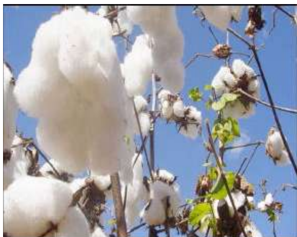
Fig. 8: Cotton plant

A climatic zoning of the Northeast Region of Brazil for herbaceous cotton culture was carried through. The results were gotten through analysis of the water balance and average, maximum and minimum temperatures for meteorological stations located in 23 cities in the region. Two-thirds of the cities were considered apt for the herbaceous cotton culture [36].