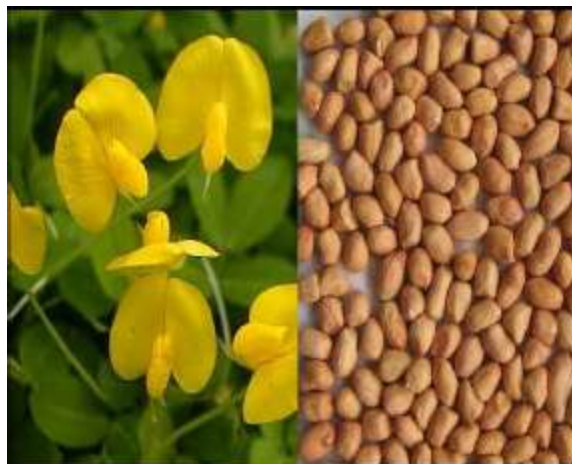
Fig. 9: Peanut flowers and seeds

Peanut: Peanut ( Arachis hypogaea ) is an important crop grown worldwide. It is an annual crop widely cultivated in warm climates and has short lived yellow flowers (Fig. 9).