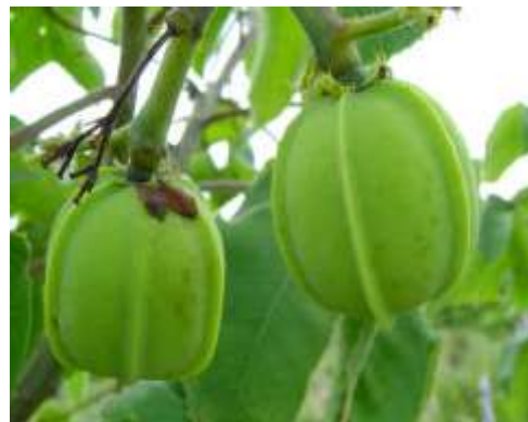
Fig. 2: Physic nut crop

Physic Nut: The interest in using physic nut ( Jatropha curcas ) as a feedstock for the production of biodiesel is rapidly growing. The oil produced by this crop can be easily converted to biofuel, which meets the American and European Standards. Additionally, the press cake can be used as a fertilizer and the organic waste products can be digested to produce biogas. The plant itself is believed to prevent and control soil erosion or can be used as a living fence or to reclaim wasteland. Physic nut is still a wild plant, which can grow without irrigation in a broad spectrum of rainfall regimes, from 250 up to 3000mm per annum. Furthermore, this crop is reported to have few pests and diseases, but this may change when it is grown in commercial plantations with regular irrigation and fertilization [12].