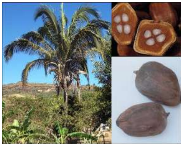
Fig. 7: Babassu tree and fruits

The results obtained were used for spatial analyses by using a GIS to obtain a final map. The main results were an African palm agroclimatic aptitude map for the State of Pará with indication of the areas classified as good, moderate and restricted and the definition of four levels of climatic risk for the crop cultivation in the African palm plantation (with very low or without climatic risk, with small climatic risk, with moderate climatic risk and with great climatic risk) [44].