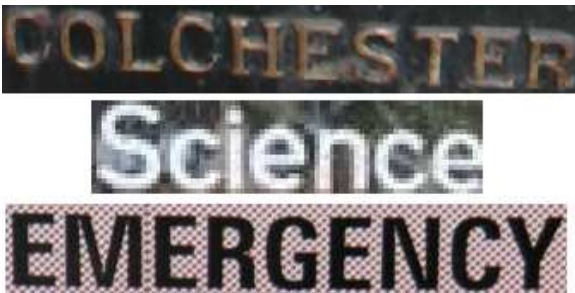
Figure 3. Example extracted words.

The aim of these competitions is to find the system best able to read single words that have been extracted camera-captured scenes. The word recognizer takes two inputs: a file of words to be recognized, and a dictionary file. For these experiments a custom dictionary is supplied that has 100% coverage of the words in the images. The term word is used loosely here to mean any string of characters that the image taggers approved as a word, and some of the character strings would not be in a conventional dictionary. To simplify our software, we designed the character recognizer interface to operate in an identical manner to the word recognizer, except that words are restricted to be one character in length. Despite several expressions of interest, we received no submissions for these contests in time to include in this paper. Example word and character images or shown in Figures 3 and 4 respectively.