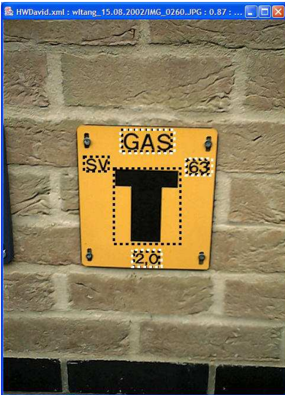
Figure 6. An image where HWDavid beats Ashida.

slower than HWDavid, though a little more accurate.