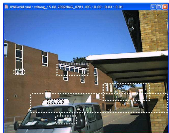
Figure 5. An image on which both leading algorithms score poorly.

Figure 7 shows a case where Ashida correctly locates the text (“15”) in the image and achieves an f -score of 0.88, but HWDavid returns no rectangles and scores 0.0.