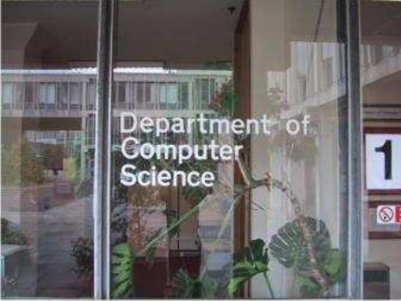
Figure 2. Example scene containing text.

Note that several design options were possible here - such as specifying that the system find complete text blocks, or individual words or characters. We chose words since they were easier to tag and describe (it would be harder to fit rectangles to text blocks, since they are more complex shapes).