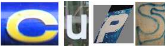
Figure 4. Example extracted characters.