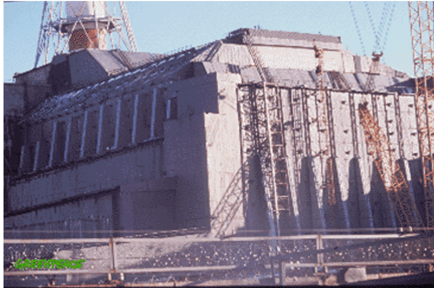
Reactor 4 Chernobyl NPS. Covered with Sarcophagus since accident in 1986. 0.96.07.02.17 DEC 1995 CHERNOBYL UKRAINE D

alias POTEMPKIN VILLAGE HOUSECLEANING PRETTY FACE QUARENTINE HIDING IT UNDER THE BED