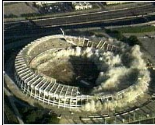
Like a set of dominoes, the former home of the Atlanta Braves collapsed Saturday

also known as TOTAL REWRITE DEMOLITION THROWAWAY THE FIRST ONE START OVER