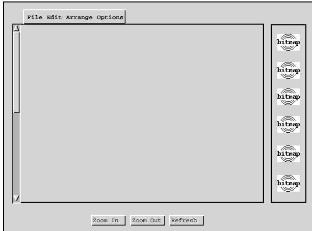
Figure 3: The sketched application from Figure 1 created with a traditional user interface builder.

ability to turn out new designs quickly is hampered by the requirement for detailed designs. For example, in one test the interface sketched using SILK in Figure 1 could be created in just 70 seconds (sketched on paper it took 53 seconds), but to produce it with a traditional user interface builder (see Figure 3) took 329 seconds, which is nearly five times longer. In addition, the interface builder time does not include adding real icons to the tool palette due to the excessive time required to design or acquire them.