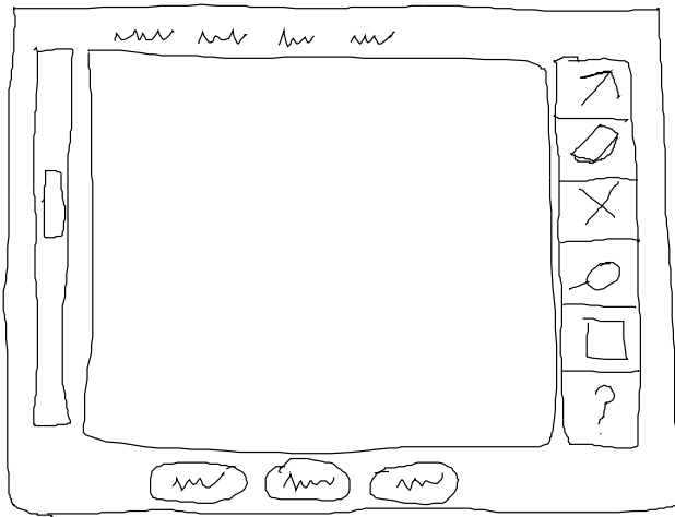
Figure 1: Sketched application interface created with SILK.

Unlike most existing tools, SILK will support the entire design cycle — from developing the initial creative design to developing the prototype, testing the prototype, and implementing the final interface. Our tool will provide the efficiency of sketching on paper with the ability to turn the sketches into real user interfaces for actual systems without re-implementation or programming. To some extent, SILK will be able to replace prototyping tools (e.g., HyperCard, Director, and Visual Basic) and user interface builders (e.g., the NeXT Interface Builder) for designing, constructing, and testing user interfaces (see Figure 2). At this time we have built a prototype of SILK that implements only a subset of the features described in this paper.