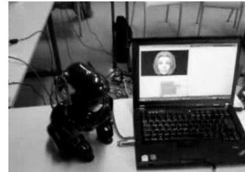
Figure 2: Greta and the Aibo dog.

We have described an architecture for Greta, an expressive ECA. Our system can generate listener behavior while interacting with the user. The video ( http://www.tsi.enst.fr/~niewiado/AAMAS_09/video1.avi ) shows the interaction between the human speaker and Greta in the role of the listener. In the video one can see Greta sending backchannel signal in reaction to user behavior.