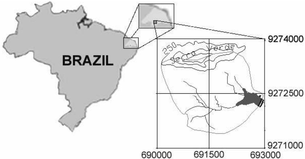
Figure 1. Geographical coordinates of catchment area

The study area is located approximately 300 km west from Natal, state of Rio Grande do Norte. It is located within the Espinharas river watershed in northeastern semiarid zone. The catchment area is 3,82 \text{km}^2 (Fig. 1). It has been environmentally protected for many years by IBAMA (Brazilian Institute for Environmental Protection) Administration, Brazilian government. It is topographically located at the Espinharas watershed boundary. Research area relief is partially hill slope; a topographically closed basin presents an alluvium area located upstream a reservoir used to storage water for human consumption.