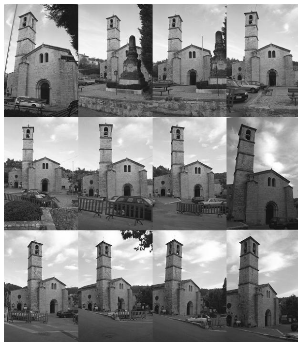
Figure 2: Twelve pictures of the Valbonne Sequence

There are as yet no standardized data sets for testing wide baseline matching algorithms. However, there is one data set that has been used in a number of wide baseline matching papers (Schaffalitzky and Zisserman, 2002, Ferrari et al., 2003, Martinec and Pajdla, 2002), which is the Valbonne church sequence as shown in Figure 2.