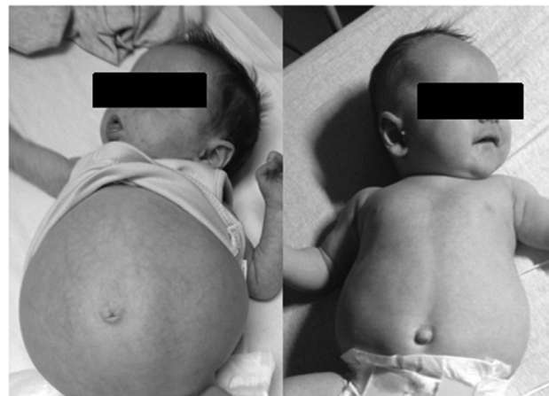
Abstract G361 Figure 2 Clinical improvement via photography