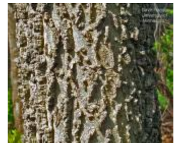
Figure 9: Corky hackberry bark.