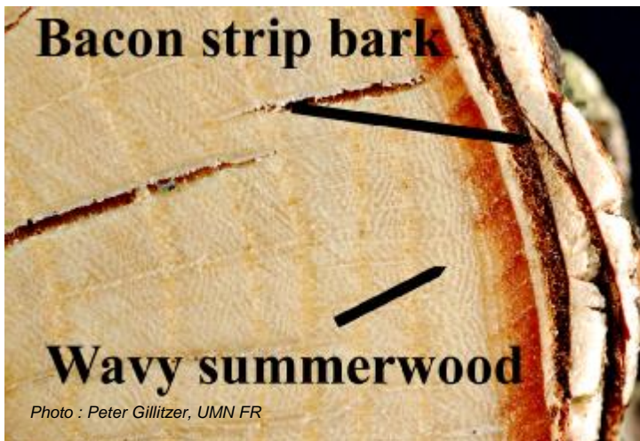
Figure 6: Summerwood is wavy. Bark resembles bacon strips.

End grain– ring porous: Summerwood: small pores arranged in a wavy "tire track" pattern (Figure 6). Sapwood: white to tan colored. Heartwood: brown to reddish brown.