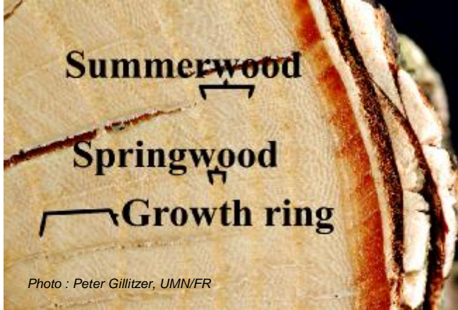
Figure 4: Group examples- oak, elm (including hackberry), and ash

Ring Porous. Within an annual growth ring there will be two regions– springwood (distinctly larger pores) and summerwood (distinctly smaller pores).