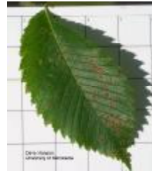
Figure 7: Leaves of elm group (including hackberry) have an oblique base.

Exception: Hackberry, another member of the elm group, also has summerwood pores arranged in a wavy "tire track" pattern. However, it is not susceptible to DED. Also, its bark is characteristically corky and rough (Figure 9).