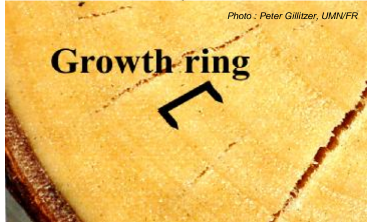
Figure 5: Group examples- maple (including boxelder), birch, some poplars, basswood (a.k.a. linden), ironwood, buckeye, and black cherry

Diffuse Porous. Within an annual growth ring, springwood and summerwood are not distinctly different. Wood within an annual ring looks uniform.