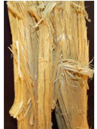
Figure 8: Stringy firewood characteristic of some elm species.

Note: Split sections of American and rock elm can have stringy, long grain wood (Figure 8).