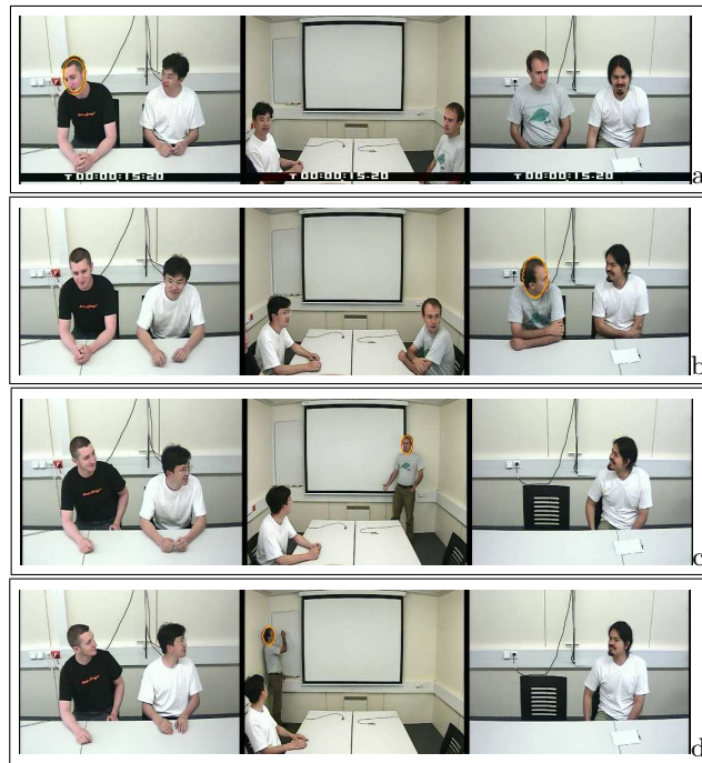
Fig. 2. Tracking speakers in the meeting room. Frames 100, 1100, 1900, and 2700.

switching. In the third place, we asymmetrically handle audio and video in the PF formulation. Audio localisation information in 3-D space is first estimated by an algorithm that reliably detects speaker changes with low latency, while maintaining good estimation accuracy. Audio and skin-color blob information are then used for prediction, and introduced in the PF via importance sampling , a technique which guides the search process of the PF towards regions of the state space likely to contain the true configuration (a speaker). Additionally, audio, color, and shape information are jointly used to compute the likelihood of candidate configurations. Finally, we use an AV calibration procedure to relate audio estimates in 3-D and visual information in 2-D. The procedure uses easily generated training data, and does not require precise geometric calibration of cameras and microphones [22].