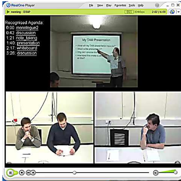
Fig. 4. Simple meeting browser interface, showing recognised meeting actions.

main source of information for reliable recognition, while video mostly helped in reducing monologue and discussion errors.