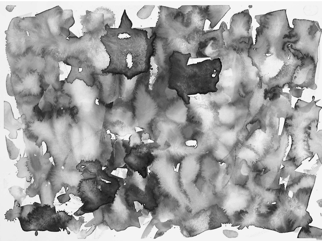
Figure 3 Expand 10 , 2012. Watercolor on watercolor paper, 15 × 20.5 inches (unframed). Private collection of Eduardo Pereira, Toronto, Ontario, Canada.

more than an aesthetic device: it is a strategic tool that operates to prioritize chance. Color and chance are thus coupled in his work.