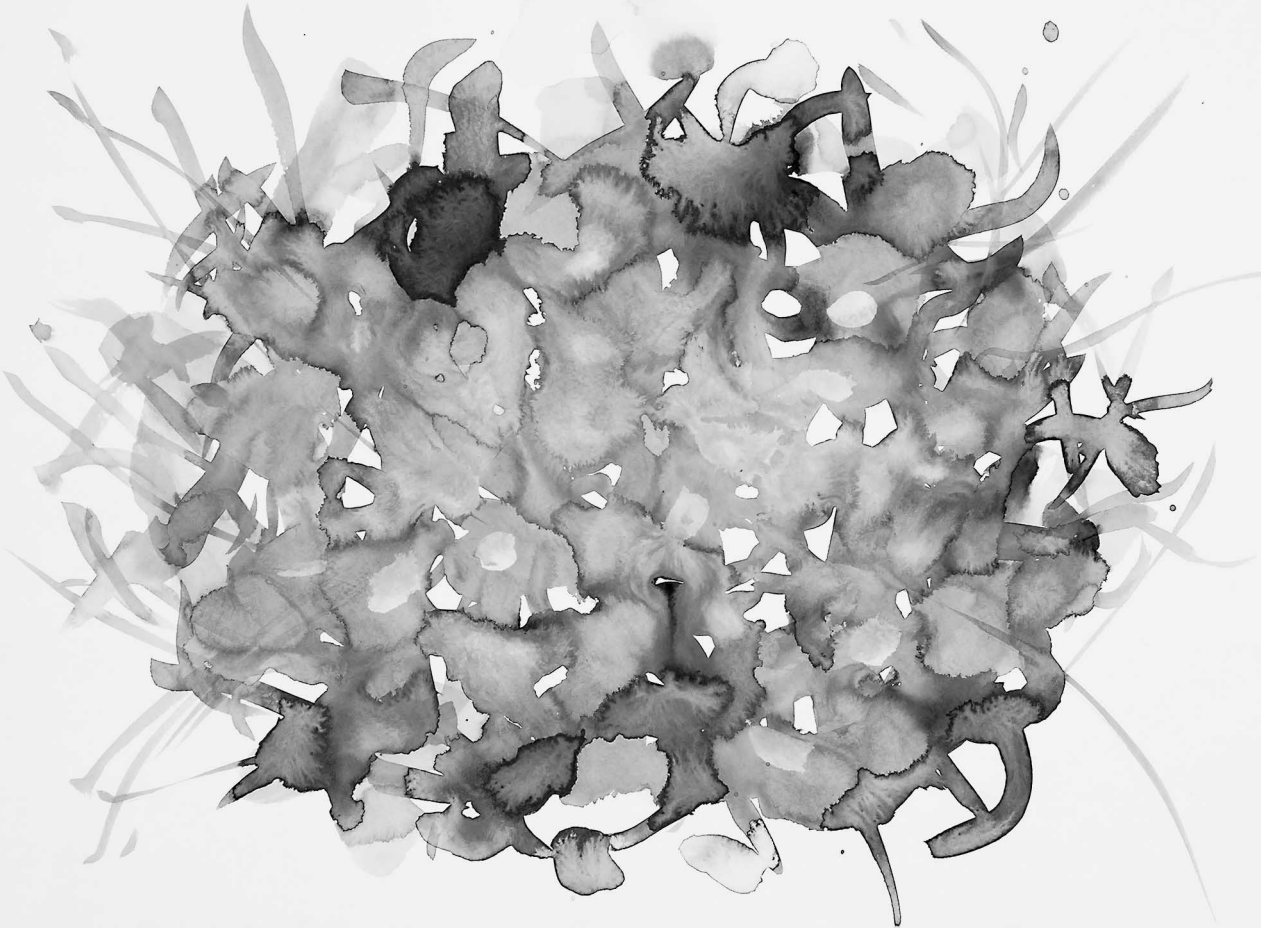
Figure 1 Nest 1 , 2011. Watercolor on watercolor paper, 15 × 20.5 inches (unframed).

In Karel Appel: A Gesture of Colour , Lyotard outlines his concerns about the sublime, chromatic intensity, and the powerful pairing of color and matter. He also continuously refers to gesture, describing Appel's work as an archive of many gestures: "The painter is the first dancer of his work" (Lyotard 2009a: 47). With his reference to the "painter's paw" (Lyotard 2009c: 189), Marcel Duchamp's derogatory term (Tomkins 1965: 24), Lyotard by contrast suggests that the painter-mind inhabits an animal state, the creative process precluding