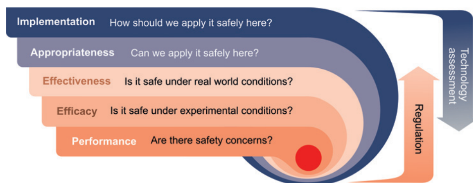
Figure 2 Questions about safety. Different questions about safety are asked at different stages in the introduction of technology.

The responsibility for training might be unclear. When laser laparoscopic surgery was introduced in the UK, it was neither