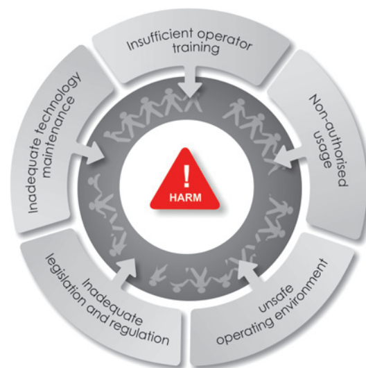
Figure 3 Factors contributing to 'unsafe' technology in developing countries. A variety of factors can contribute in isolation or combination to make 'safe' developed world technology unsafe in the developing world.

The UK has several such overlapping systems. The Medicines and Healthcare Products Regulatory Agency (MHRA) collects reports on problems with medical devices from patients, healthcare practitioners and manufacturers. Around 8000 reports each year are collected; in 2007, this led to 79 alerts being issued, some of which were serious enough to warrant immediate action. 13 Also, in the UK, 23 700 reports concerning the safety of medical devices were collected by the National Patient Safety Agency in the same year. 14 A further source of information is the General Practice Research Database, a database containing the anonymous records on patients registered at over 480 general practices in the UK, and also managed by the MHRA. 5 This database can be used to monitor the safety and