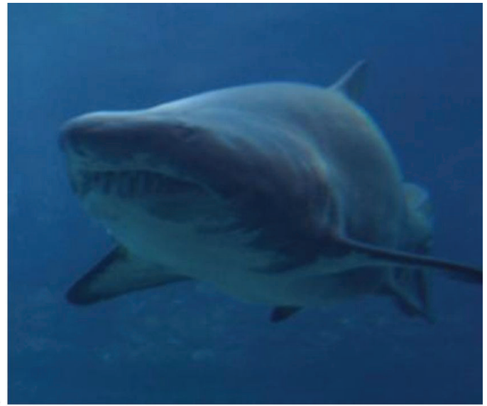
A. Figure 2. Sharks popular in public aquariums; (a) nurse shark ( Ginglymostoma cirratum ), (b) sand tiger shark ( Carcharias taurus ).