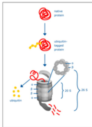
revised Figure 1

Proteins are tagged with multi-ubiquitin chains and targeted for degradation by the 26S proteasome. The 26S proteasome consists of a catalytic core, the 20S particle, and two 19S regulatory complexes. Upon binding of the protein substrate to the 26S proteasome, ubiquitin chains are recycled, the protein is unfolded, and degraded into small peptide fragments. The 20S core has a barrel-like structure with two outer \alpha and two inner \beta rings consisting of seven different subunits each.