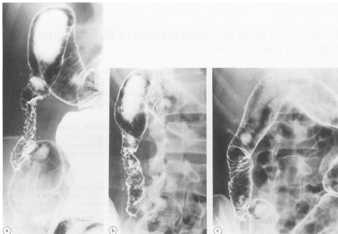
Fig. 1 Barium enema showed a broad circular stenosis with a cobblestone appearance from the caecum to the ascending colon, with destruction of the Bauhin's valve, with marked dilatation of the terminal ileum, and with ulcer scars in the right-transverse colon before treatment (a), and showed improvement of the stenosis and mucosal abnormalities of the colon with anti-tuberculous drugs treatment at four weeks (b) and at eight weeks (c). (Patient 1.)

five days after start of this treatment, biopsy specimens were taken from the terminal ileum epithelioid cell granulomas were found to be present. The stenosis of the ascending colon was released, and biopsy specimens taken revealed moderate inflammatory infiltrates of plasma cells, lymphocytes, and eosinophilic cells, and a distinct decrease in number of macrophages and monocytes, and no epithelioid cell granuloma. A large number of the atypical mycobacterium were present in smears of the biopsy material of the ascending colon, however, and were verified by culture. Barium enema showed gradual improvement of the stenosis and mucosal abnormalities after treatment (Fig. 1b, c). Intramuscular injection of streptomycin 1 g/day has continued for six weeks, then twice a week for 14 weeks. Ninety one days after start of the treatment, a large number of the same atypical mycobacteria were present in smears of the biopsy material, ethambutol was added to this treatment. The granulomatous nodule in the perianus was surgically resected on 116th hospital day, and revealed infiltration of chronic inflamma-