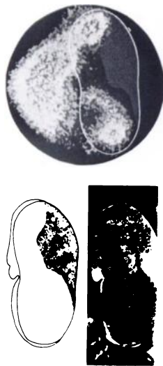
FIG. 3. Correlation between second scintigraphic examination, pathologic changes in the removed spleen, and operative findings. Lower right: cut surface of spleen shows infarcted area, as sketched at lower left. Above: line drawing is superimposed on scintigraphic image, showing position of spleen in abdomen. Note that only the lower and upper poles of the spleen have taken up the radionuclide.

In the case described, attention was drawn to splenic disease by the first TcSC study, which failed to show uptake of the colloid in the spleen. The