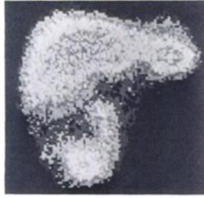
FIG. 2. Second TcSC scan. Note colloid uptake in left upper abdomen and right lower abdomen.

Splenectomy was performed, followed by an uneventful recovery.