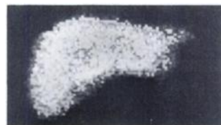
FIG. 1. Tc-99m sulfur colloid scan on admission. No uptake in spleen.

Laboratory investigations included Hb of 7.8 g%,