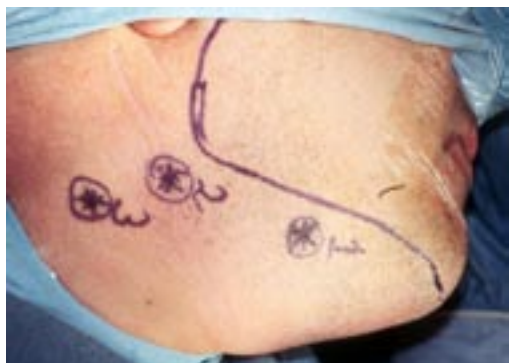
Fig. 1. Marking the position of the identified sentinel node on the skin.

The patient was immediately transferred to the nuclear medicine service where a static lymphoscintigraphy was carried out, marking the position of the identified sentinel node on the skin. (Fig. 1) Eighteen hours later, and with the patient already anesthetized, 1 ml of blue dye (Patent Blue V, Guerbet laboratories, Cedex, France) was infiltrated in the same points. The sentinel nodes were located using a gamma probe, and identified by level. Once the sentinel node or nodes had been extracted, an elective dissection of stages I-II-III (supraomohyoid) or modified radical type III (levels I to V) was made as control in those cases where the lymphoscintigraphy showed involvement at lower levels.