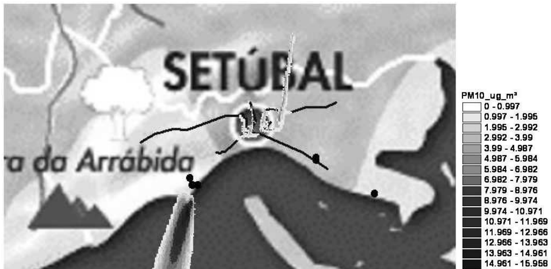
Figure 3. Particle concentration (PM10) from industries and traffic for scenario B, stable category.

Traffic sources are important for some pollutant but affect only areas near the roads, comparing with other sources, so it is possible to say that the centre of the city is mainly affected by its own activity.