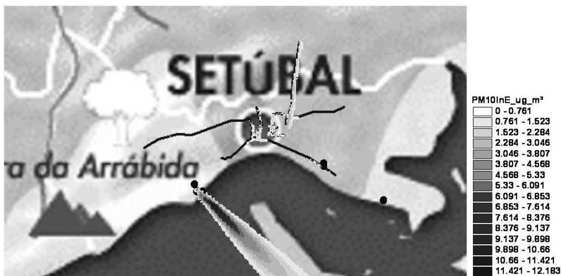
Figure 4. Particle concentration (PM10) from industries and traffic for scenario D, stable category.