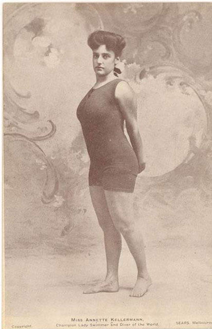
Figure 2. Annette Kellerman, early 1900's.

covered most of the skin, and was most commonly fabricated out of wool – a highly impractical, yet socially acceptable material. In one highly publicized instance, Annette Kellerman (1886–1975) – an Australian professional swimmer, diver and film star – was arrested in 1907 on a beach in Boston by US police officers. They waited for her as she got out of the water, condemning her for wearing 'inappropriate attire' in public – a form-fitting one piece that exposed her legs and her arms. Although this may have been an extreme case, it is important to recognize that 'moral police' were indeed a reality for the women of Britain and the US during the 19 th and 20 th centuries, creating a fear of both social and judicial punishment for challenging social regulations on dress codes.