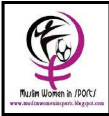
Logo of ©MWIS Blog