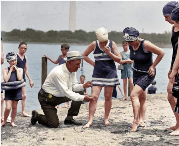
Figure 1. 'Moral Police' on a beach in the U.S.

Europe and North America, although historically many middle-class women objected to the social norms of attire that restricted their mobility, the cost of breaking these norms was often too heavy and few women were willing or could afford to go against their own culture. Despite some accepted changes to particular dress codes, for the most part any deviation from appropriate social attire would easily lead to a public audience questioning women's morality and social identity.