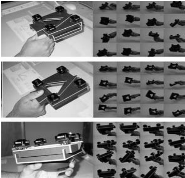
Figure 1: From top to bottom: RISP1, RISP2, RISP3

set where they had to formulate an overall positioning of the three props. This final rating was used in our analysis.