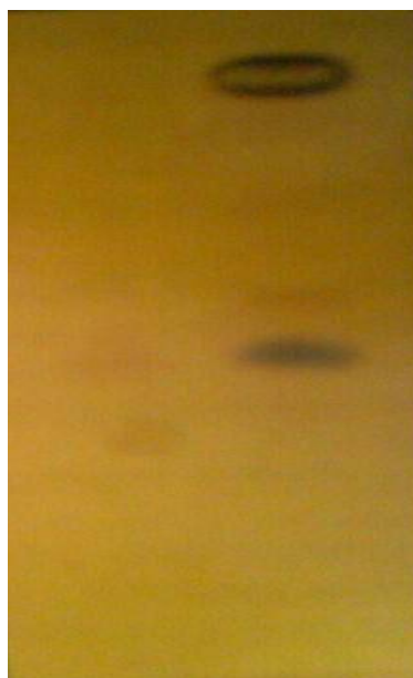
Figure.6: TLC profile of test solution of Terminalia Arjuna Stem bark (Test solution derivatized with ferric chloride solution Elaagic Acid Standard)