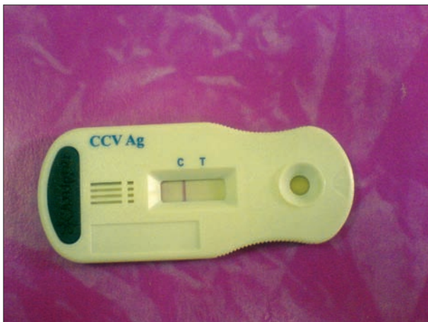
Fig. 1: Effect of chronic (15 days) oral administrations of curcumin on the paw edema induced by intraplantar injection of formalin in rats. * p < 0.05 compared with other groups in each mentioned time, n: 8 rats in each group, po: per oral, ipl: intraplantar.