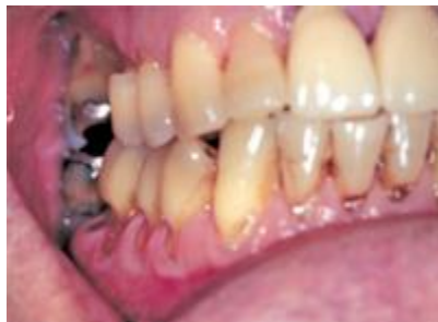
Figure 1. Multiple illustrations of abfraction lesions as indicated by arrows. Note the wedge-shaped notch and the eccentric occlusion, which has placed tensile forces at the cervical areas of both anterior and posterior teeth of both arches.

Abrasion can be accelerated by erosion, as the combined effect of abrasion and erosion is greater than either process on its own. 23-25 In one study that compared abrasion and erosion, the outcome of the two processes combined was 50% greater than the outcomes from either of the processes alone. 25 In a literature review on NCCLs, Bartlett and Shaw 8 concluded that there is overwhelming evidence from clinical and laboratory studies that abrasion and erosion are linked to NCCLs, yet data also support the theory that NCCLs are caused specifically by abrasion or erosion alone.