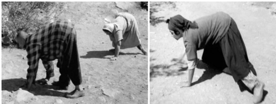
Figure 2 Quadrupedal walking by three affected subjects. Note palmigrade walking with hands fully touching the ground. Knees, elbow joints, and back are straight, and there is a rhythmic alternating pattern of motion most of the time (see also supplementary video at http://www.jmedgenet.com/supplemental ). (Photographs are published with consent.)

reelin cause autosomal recessive lissencephaly with cerebral hypoplasia in humans and the reeler phenotype in mice which is characterised by impaired motor coordination, tremors, and ataxia. These conditions have been subsumed under the term lissencephaly with cerebral hypoplasia. 11 The affected individuals reported here have some overlapping features with other non-progressive cerebellar hypoplasias. These include ataxia, intentional tremor, mental retardation, strabismus, and dysarthria, but abnormalities of gyration as reported for the VLDLR mutations were not observed. Interestingly, all the patients with VLDLR mutations learned to walk very late and some were described as having such a severe form of movement disorder that independent walking was not possible. Similar observations were made in a different form of cerebellar hypoplasia described in a large inbred Lebanese family. However, in none of these cases has compensatory QL been described. 10 We conclude that QL is specific to the family described here and not a compensatory mechanism for their ataxia. However, we cannot exclude that early and sufficient treatment might have altered the outcome in the affected subjects. The genetic defect in this family disrupts the normal development of the cerebellum, the nucleus dentatus, and the corpus callosum. In addition, it is likely to affect yet unknown neuronal circuits that control bipedality.