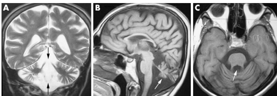
Figure 3 MRI of the index patient showing coronal (A), sagittal (B), and transverse (C) sections. Note cerebellar hypoplasia and hypogenesis and midline clefting of the cerebellar vermis (A, B arrows), enlargement of the fourth ventricle (C, arrow), and hypoplasia of the corpus callosum (B).