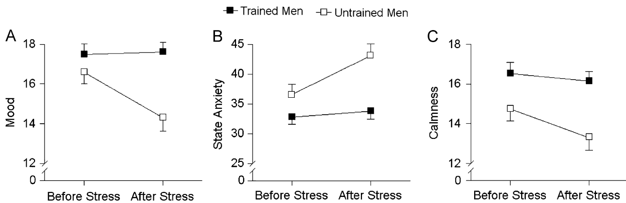
Figure 3 Mean levels (with SEM bars) of mood (A), anxiety (B), and calmness (C) before and after psychosocial stress exposure in trained and untrained men.