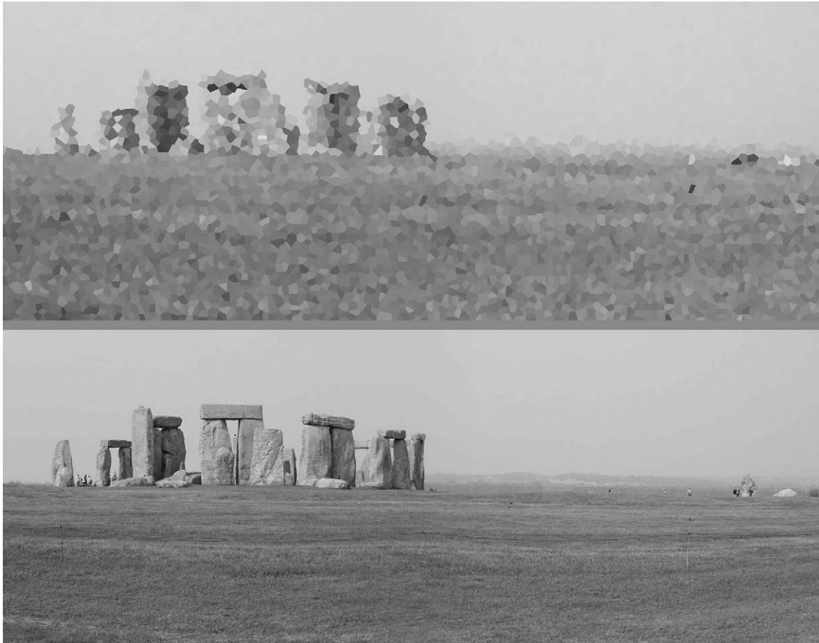
Fig. 3. Identity appears only when the elements of a landscape are coherent and become legible.

and functions are necessary for cultural landscapes to survive?