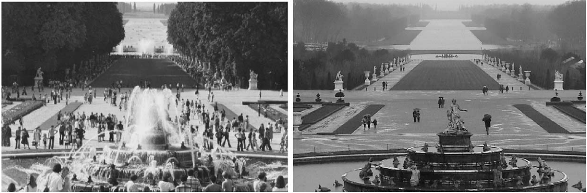
Fig. 2. Versailles before and after the disaster of 1999. The storm destroyed most of the park, but its restoration can follow other principles than the ones used for managing until now and a more authentic landscape can be recreated.