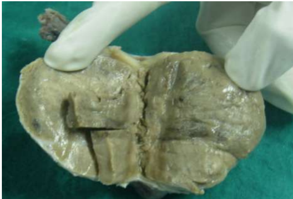
Figure 1: Gross photograph showed capsulated tumor mass having grey firm cut surface. -No normal testicular tissue is identified.