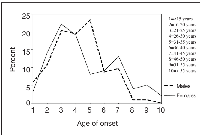
Figure 2 Distribution of age of onset of schizophrenia in males and females

nia. Among early-onset patients, females have a significantly earlier age of onset than males, and among late-onset patients, they have a later age of onset.