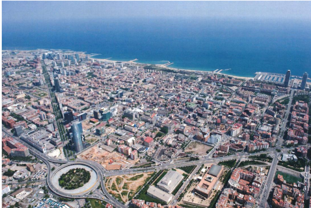
Fig. 1: 22@ District in Barcelona