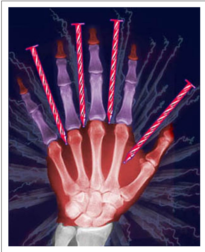
Figure 1. 'hand pain' by jilly999. CC BY 4.0.

produced abstract patterns and used more colour than other users, in part as a reference to visual disturbances experienced by many as part of migraine. These images evoke disturbance of norms, showing something outside everyday experience.