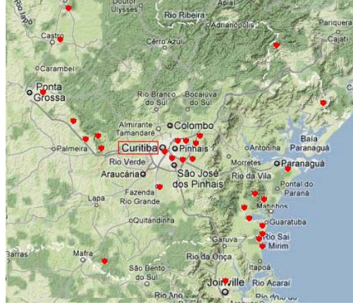
Fig. 2. Geographic location of the bird sound recordings

A second database was derived from the initial one: the original audio recordings were split according to pulses. As explained we define “pulse” as a short sound interval with high amplitudes. These segments seems to better characterize the bird vocalization, and their use improves the identification