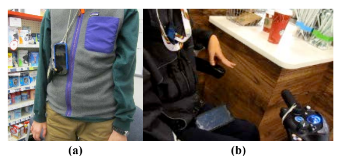
Figure 1. Two study participants in the contextual sessions: (a) phone is hanging by a lanyard around the neck, and (b) phone is on the lap.

http://dx.doi.org/10.1145/2661334.2661372