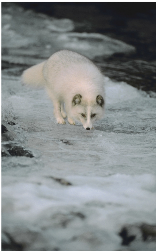
Figure 1. Arctic fox Alopex lagopus .

Although the expansion–contraction model might broadly describe the response of temperate species to the fluctuations in temperature during glacial cycles, it might not be appropriate for species that are adapted to cold environments. Not only are cold-tolerant species good candidates for survival in northern cryptic refugia, it is likely that many, such as the Arctic fox Alopex lagopus (Figure 1), reindeer Rangifer tarandus , mountain avens Dryas octopetala and dwarf birch Betula nana would have had larger distributions during colder periods than they do today. Such species expand their distribution during glacials and contract during interglacials [10,75]. Many are thus currently in their contraction phases, and it has been suggested that current-day and future warmer conditions might represent their refugial phases. Others have highlighted the fact that these differences should be taken into account when considering the possible role of cold-temperate species in postglacial recolonisation [76], and insights into how species respond during contraction phases have also been gained through aDNA studies on Arctic species [46] (see text).