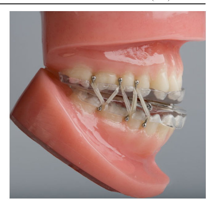
Fig. 1 Lateral view of the mandibular advancement device (MAD) used in this study

The study consisted of six PSG recordings per patient: a baseline recording at the hospital, four ambulatory recordings at home, and a follow-up recording at the hospital. The patients received the MAD on average 5 weeks before the first ambulatory recording at home. The patients were instructed to wear the MAD every night upon delivery.