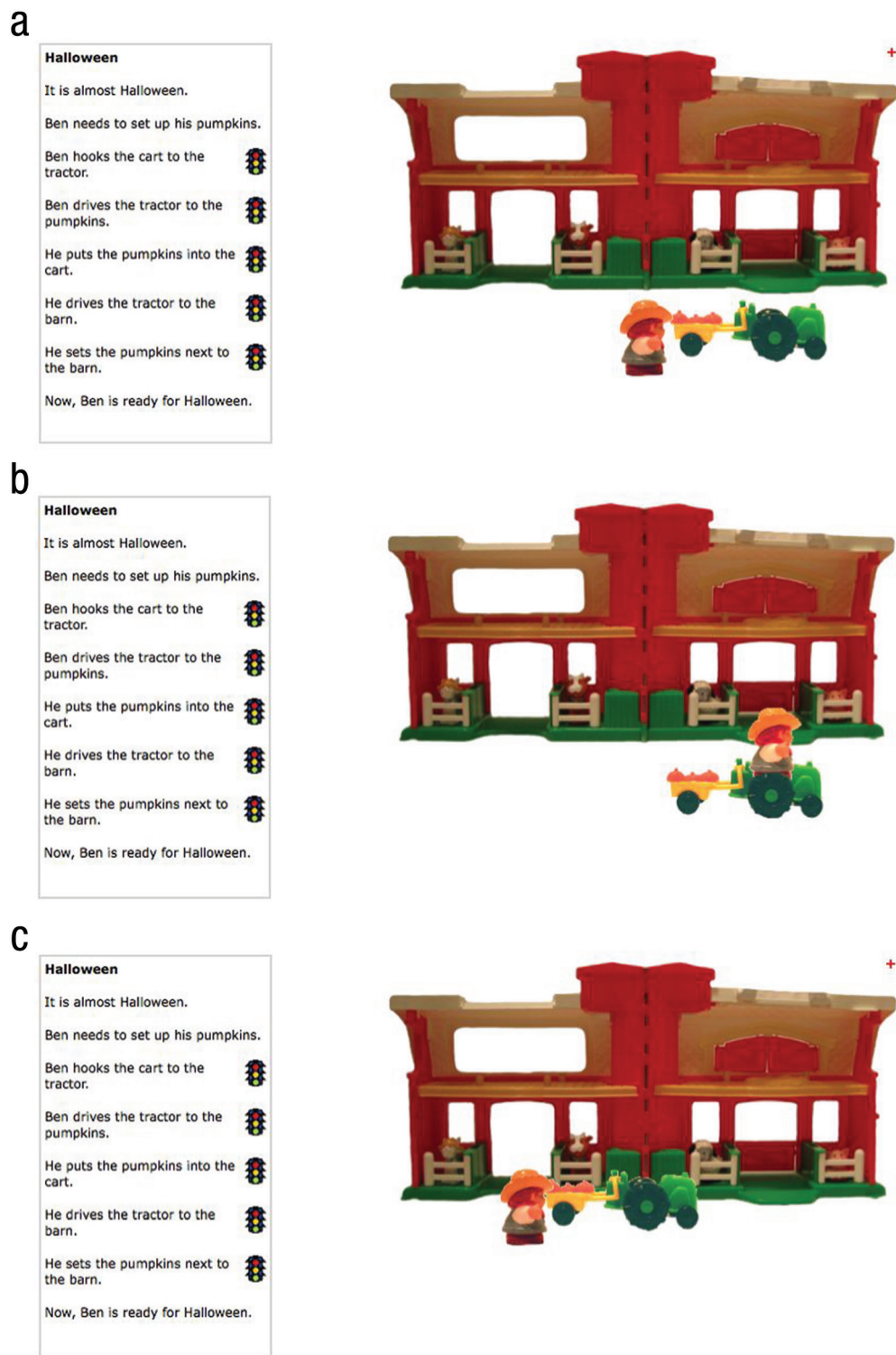
Fig. 2. The screenshots illustrate physical manipulation (a) before reading the sentence “He drives the tractor to the barn” (b) midway through manipulating for the sentence, and (c) after successful manipulation. The green traffic light is the signal for the child to manipulate the toys to correspond to the sentence.