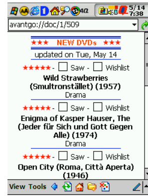
Figure 2: MovieLens Unplugged DVD recommendations: iteration one shown on a PocketPC

Another question we investigated with respect to occasionally connected devices was whether there were times when users could not accomplish their chosen task because they were offline. The responses from our users were fairly evenly split. Some users could accomplish all of their tasks without any additional online information. Other users missed the ability to search interactively. Still others found the unavailability of outside reviews to support recommendations to be an obstacle. A final point of confusion for many users of the AvantGo channel is summed up by the following user: