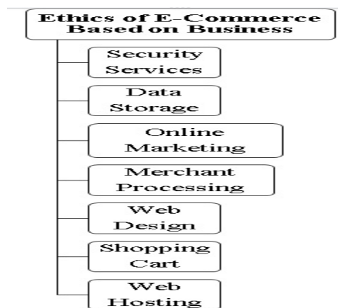
Fig 2. Ethics of E-commerce based on business

Therefore biggest advantage of E-Commerce is the ability to provide secure shopping transactions via the internet and coupled with almost instant verification and validation of credit card transactions. This has caused E-Commerce sites to explode as they cost much less than a store front in a town and has the ability to serve many more customers. The basic ethical component of e-commerce based on business given fig 2.