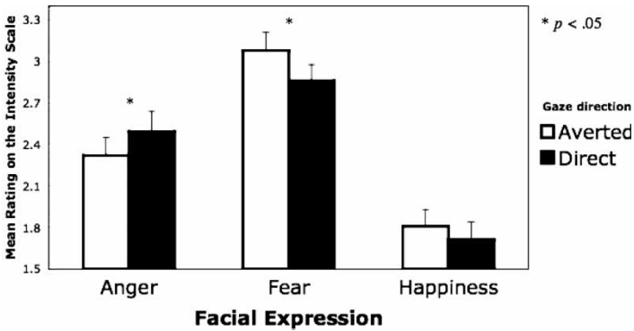
Figure 3. Mean intensity ratings of emotion in the face as a function of expression and gaze (+SE).

As shown in Figure 3, the predicted two-way interaction was again observed between emotion (anger vs. fear) and gaze direction (direct vs. averted), F(1, 33) = 7.9, p < .01, \eta = .44 . Anger was judged as more intense with a direct than with an averted gaze, F(1, 33) = 4.8, p < .04, \eta = .36 , whereas fear was judged as more intense with an averted than with a direct gaze, F(1, 33) = 4.9, p < .04, \eta = .36 . No significant difference in the judgement of the intensity of happy faces was observed according to gaze direction,